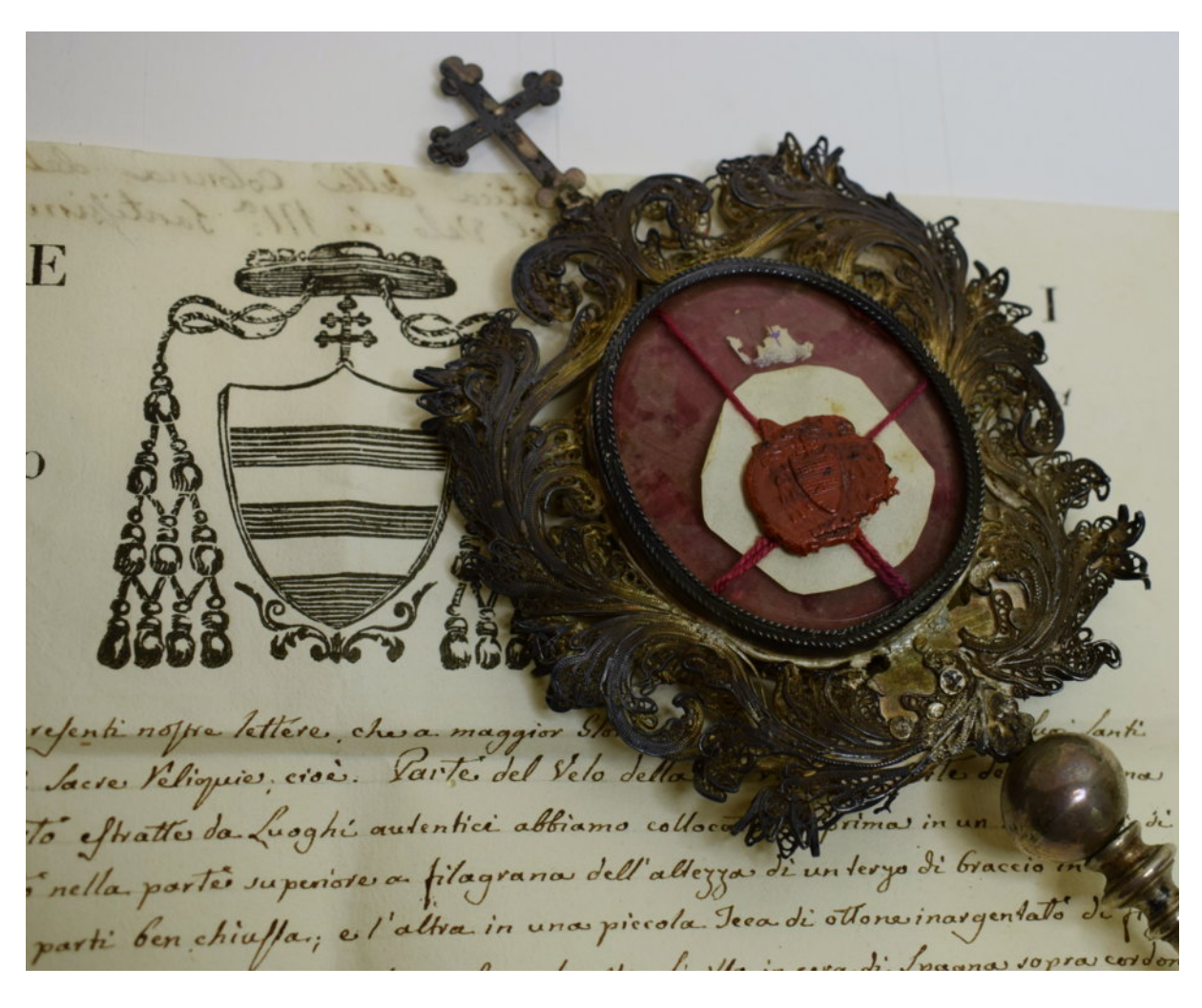
"... fitted with a crystal glass on both sides [and] closed tightly."