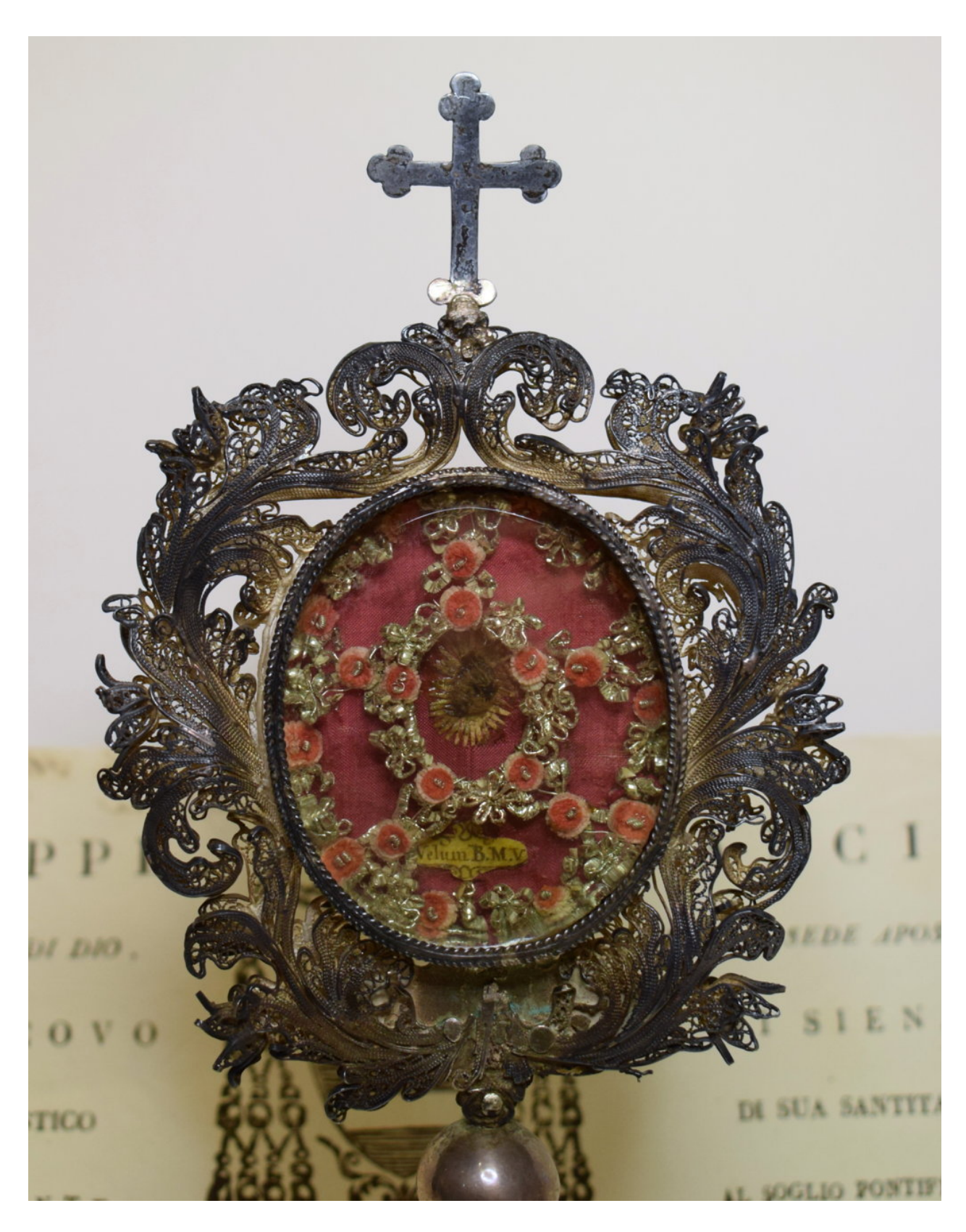
"... silver reliquary in the form of a monstrance, ... decorated on its upper part with filigree ... "