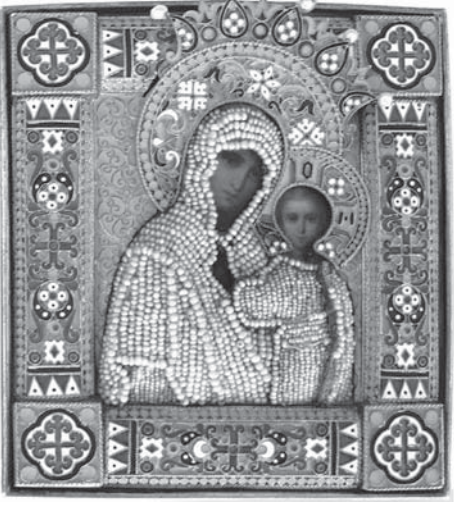
Matching wedding pair icon in gild silver, enameled covers with river pearl skirts, by Ovchinnikov. © 2014, Courtesy of www.RussianStore.com

"could quite easily find odd pieces of Russian cutlery from around $30 upwards by hunting round antique markets. Moreover, because pieces made around the turn of the century (1900) seem to be exceedingly popular, bargains may sometimes be found on earlier ones, those dating back to the 18th century. If you had a couple of hundred dollars to spend, however, the scope widens."