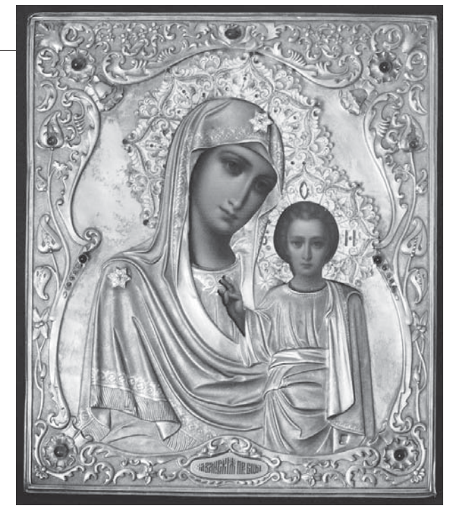
embellished by polychrome enamel and precious stones.