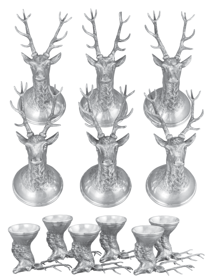
▲ Set of six Russian silver stag-form shot glasses, maker unidenfied, St. Petersburg, Russia, circa 1915. Marks: [a-right facing kokoshnik-84], KL; 3 inches high; finished at $8,125.

◀ Silver-gilt and cloisonné enamel casket, mark of Ovchinnikov, Moscow 1908/17, with silver-gilt drop scroll handles, hinged enamel clasp at front and bracket feet, enameled with scrolling flowers around a central flower-head in two shades of pink, two shades of green, red, yellow, white and four shades of blue, gilt interior, 1911, 4 7/8 inches long, 2 3/4 inches high, realized $11,500