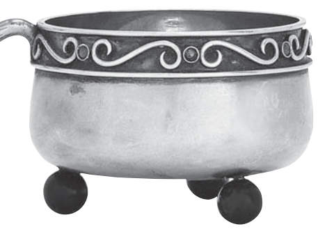
Two-color gold and gem-set vodka cup, Faberge, St. Petersburg, circa 1895, circular on three lapis lazuli ball feet, the rim with applied wirework frieze of scrolls set with rose-cut diamonds and rubies, the Norse dragon handle set with a ruby in top of its head, rose-gold interior,1 1/2 inches in diameter, realized $17,700 in November 2013.

▶ A Patnikov Russian silver and silver gilt basket, Andrei Pastnikov, Moscow, Russia, circa 1889. Marks: (Moscow), 84, AK/1889, AP (in Cyrillic), 4 inches high by 11 7/8 inches in diameter (handle down), 28.1 ounces.